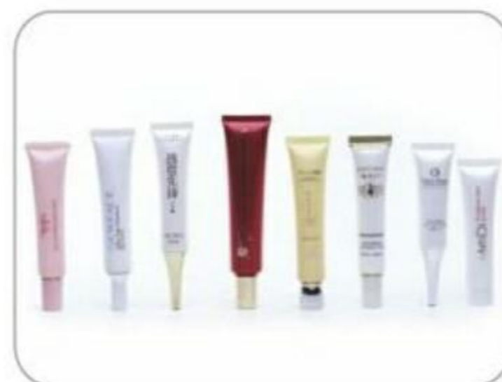
软管样品 Tube Sample