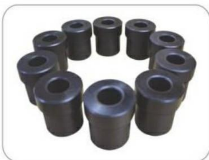
本机杯座 (根据软管尺寸定做) Tube holder (Custom made according to tube's size)